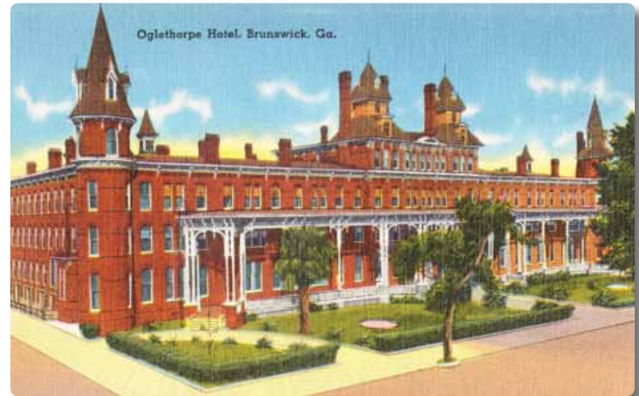
Built in 1888, the magnificent Oglethorpe Hotel is one of Brunswick’s greatest losses. It was razed in 1958 to make way for a flat-roofed motor hotel, which is also long gone. In its place now stands a former J.C. Penney building and an empty lot.